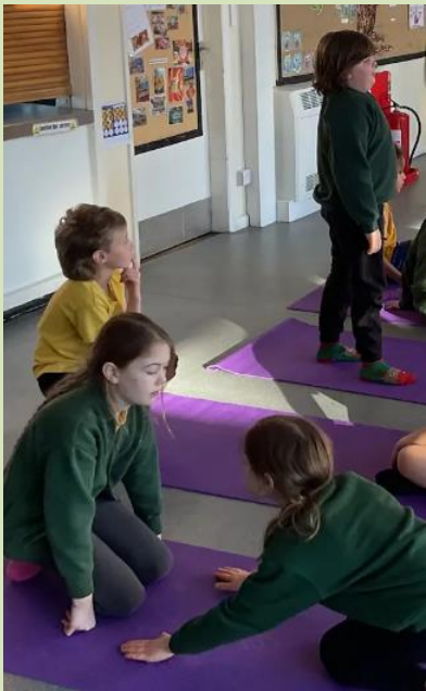
Year 4 children taking part in yoga last week.